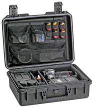
iM26XX-PHOTOPALLET Photography Pallet