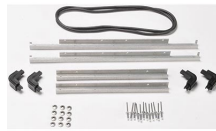
iM26XX-BEZEL-LID Lid Bezel Kit