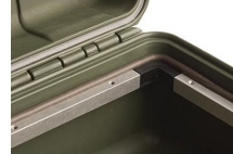
iM26XX-BEZEL Base Bezel Kit