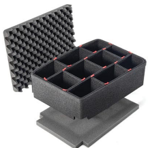
iM2620TPKIT TrekPak Case Divider Kit