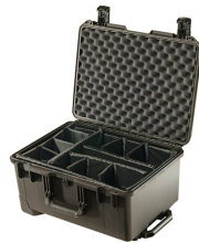
iM2620-X0002 With Padded Dividers