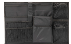
iM26XX-UTILITYORG Utility Organizer