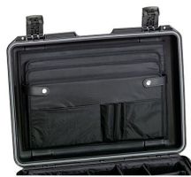
iM26XX-LIDORG Lid Organizer