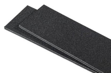
iM2620TPDIV Extra TrekPak Dividers